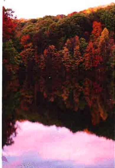
Summer/Fall 2019 AI-A-Notes